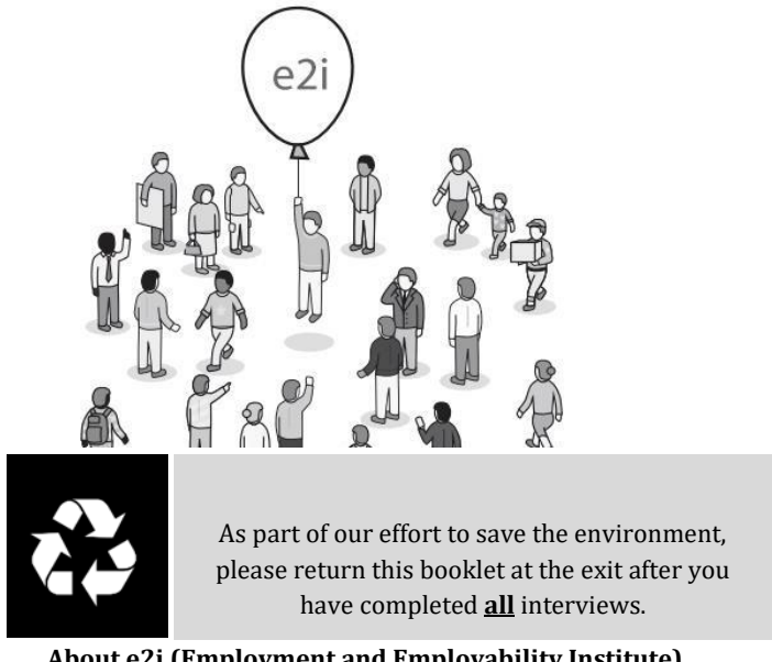
About e2i (Employment and Employability Institute)

e2i is the empowering network for workers and employers seeking employment and employability solutions. e2i serves as a bridge between workers and employers, connecting with workers to offer job security through jobmatching, career guidance and skills upgrading services, and partnering employers to address their manpower needs through recruitment, training and job redesign solutions. e2i is a tripartite initiative of the National Trades Union Congress set up to support nation-wide manpower and skills upgrading initiatives. For more information, please visit www.e2i.com.sg