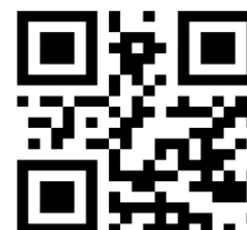
Meet an e2i Career Coach e2i.com.sg/app

You can also reach them at the following centres (By appointment only):